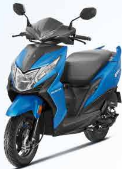
MAT MARVEL BLUE