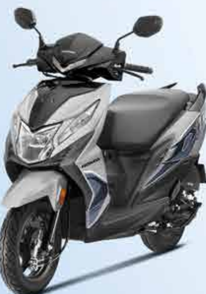
PEARL IGNEOUS BLACK + PEARL DEEP GROUND GRAY